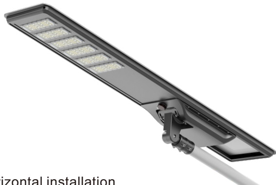
① Horizontal installation