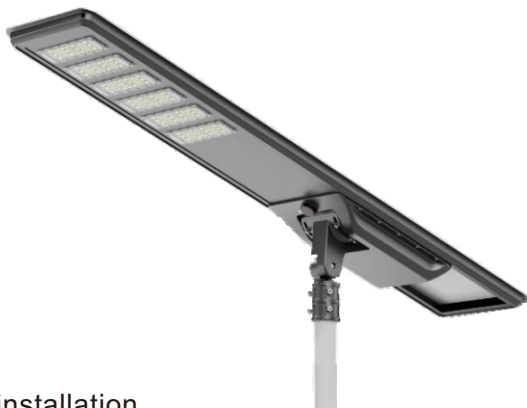
② Vertical installation